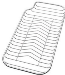
Stainless steel plate rack 8100 115