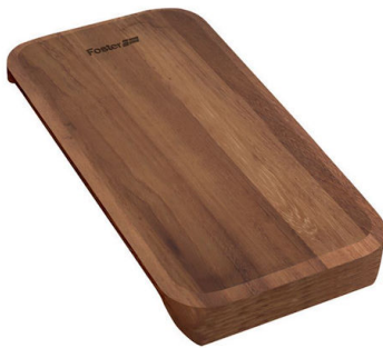
Iroko-wood sliding chopping board 8643 116