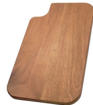
Iroko-wood chopping board 8643 115